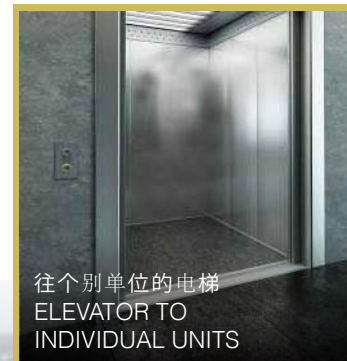
往个别单位的电梯 ELEVATOR TO INDIVIDUAL UNITS

Be the talk of town and envy of others. This spacious 4-storey shop office marks the modernization of the office address. While the ground floor units can easily support F&B and other specialty businesses, the office suites above act as a self-contained workplace. All units above enjoy the same prestigious demand.